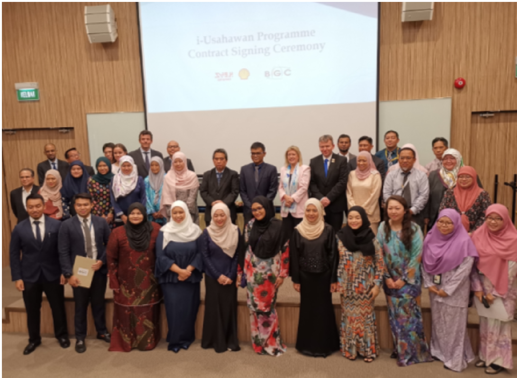
6th March 2019—Contract Signing Ceremony between BSP and BGC and the Entrepreneurs