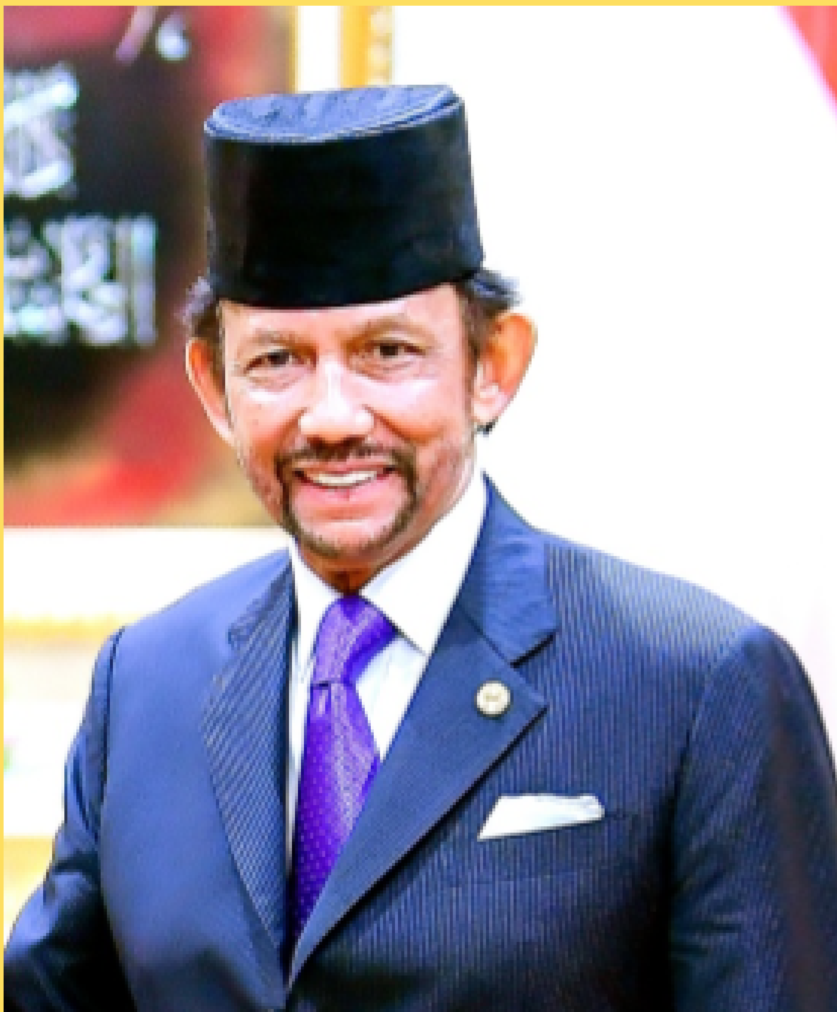
His Majesty Sultan Haji Hassanal Bolkiah Mu'izzaddin Waddaulah ibni Al-Marhum Sultan Haji Omar 'Ali Saifuddien Sa'adul Khairi Waddien, Sultan and Yang Di-Pertuan of Negara Brunei Darussalam