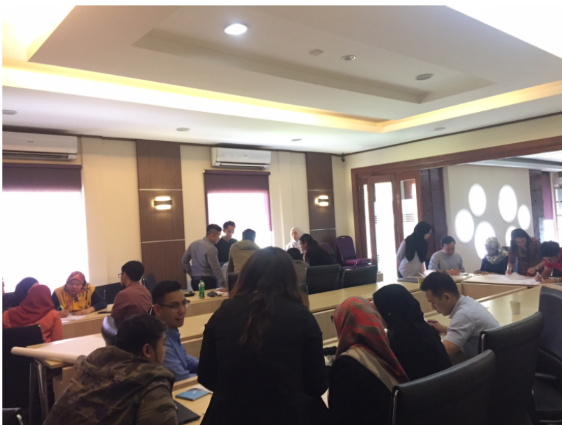
2nd July 2018—Energy Business Academy (EBA) Training by BSP