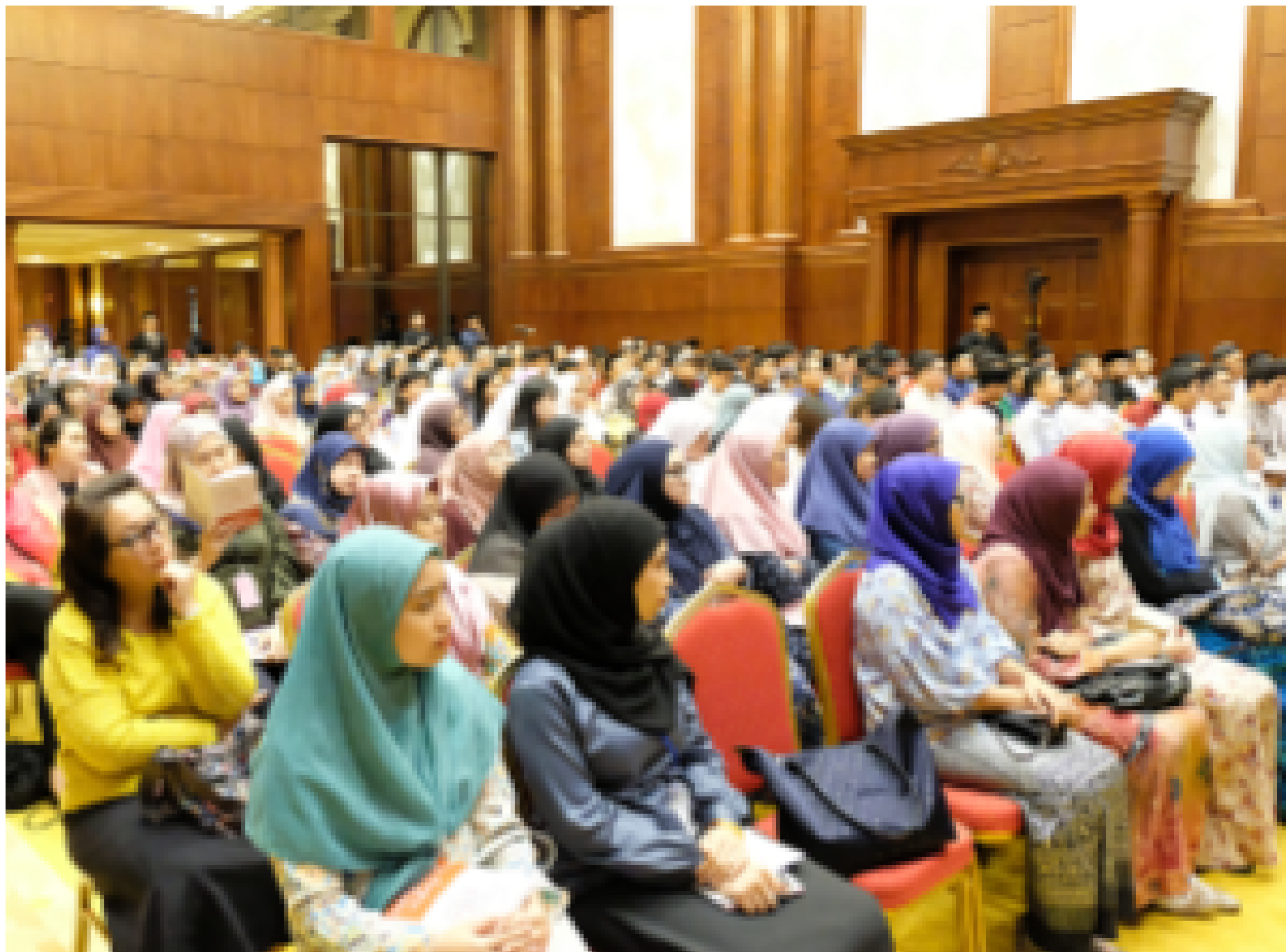
1st August 2018—13th Brunei National Youth Day